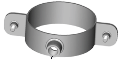
\frac{3}{8} " - 16 Threaded Connection for \frac{3}{8} " Threaded Rod or Lag Stud

Threaded rod can be attached to building using wall bracket, anchor rod or slide nut and strut channel.